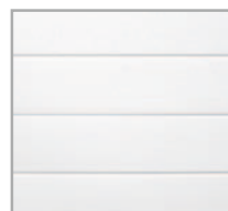
3717 Light Ribbed Panel